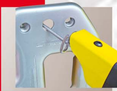
WPS 2000 - the air saw for daily use on car bodies