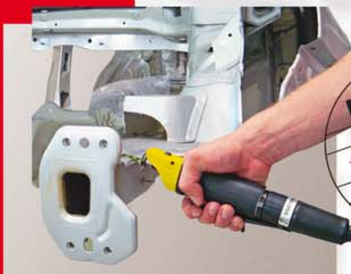
WPS 2000 - top quality and durability